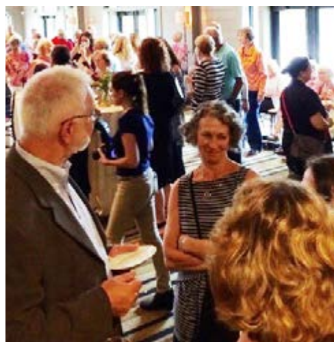
The kick-off event at LaBelle Winery in Amherst drew hundreds.