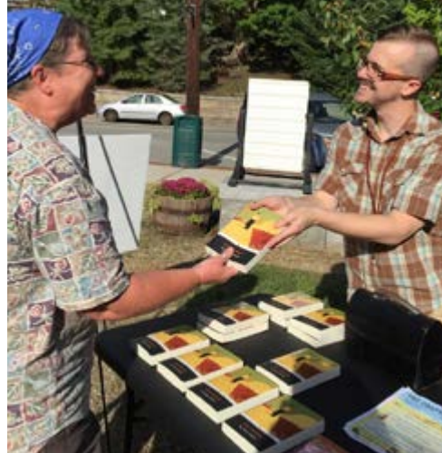
Buying books at the "Hit the Loads" program in Wilton

to town to attend different kinds of programs and think about the story, time period, and themes from other perspectives.