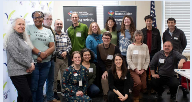
In late February, Big Watch facilitators gathered for training, reflection, and conversation as they prepare to lead screening and discussion events around the state.

Medallion Opera House, 20 Park Street Contact: randolphnhlibrary@gmail.com