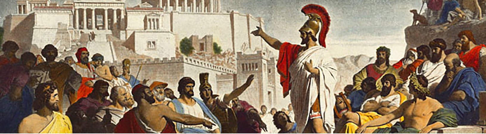
19th-century painting by Philipp Foltz depicting the Athenian politician Pericles delivering his famous funeral oration in front of the Assembly.