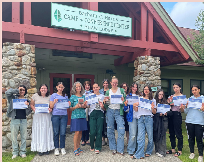
International and New Hampshire students came together in a unique collaboration between Connections and Creating Friendships for Peace .

The young women sat writing around a table at the Barbara Harris Center in Greenfield, NH, finding their memories of safety in a treasured place. This July, five Palestinian citizens of Israel and five Jewish teens from Israel and the Creating Friendships for Peace (CFP) program spent two weeks at the Harris Center, learning about peacebuilding, leadership, conflict resolution, and communication before joining host families in mixed pairs for a week-long homestay. Readings and discussions with the New Hampshire Humanities (NHH) Connections program, and teens from Souhegan High School, presented these young women with opportunities for deeper reflection, for looking at our place in the world and finding common ground in stories.