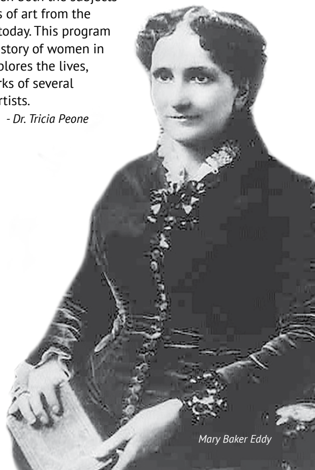
Mary Baker Eddy

For information about hosting or attending one of these programs, please visit www.nhhumanities.org/humanitiestogo .