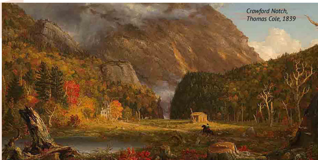
Crawford Notch, Thomas Cole, 1839