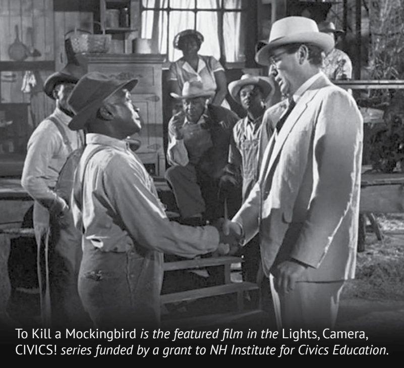
To Kill a Mockingbird is the featured film in the Lights, Camera, CIVICS! series funded by a grant to NH Institute for Civics Education.